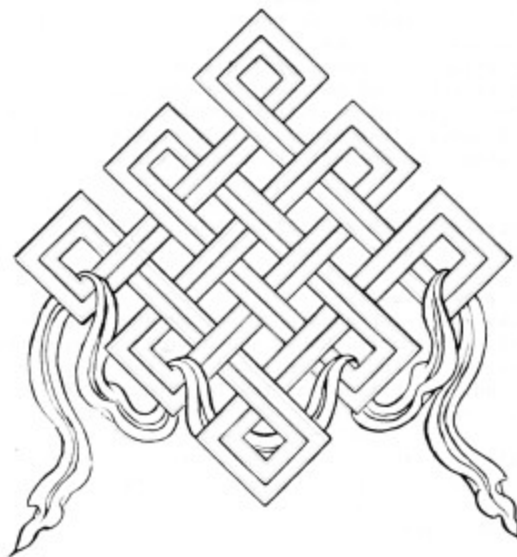
Figure 8—Endless knot

For all those ancient Indian pandits and ascetics, the best everlasting psychiatry in the power of the mind was full renunciation. We can prove it for ourselves by living that experience, but it comes only from pure practice and understanding how samsaric nature is truly in the nature of suffering. That is why Guru Shakyamuni showed us the four Noble Truths.