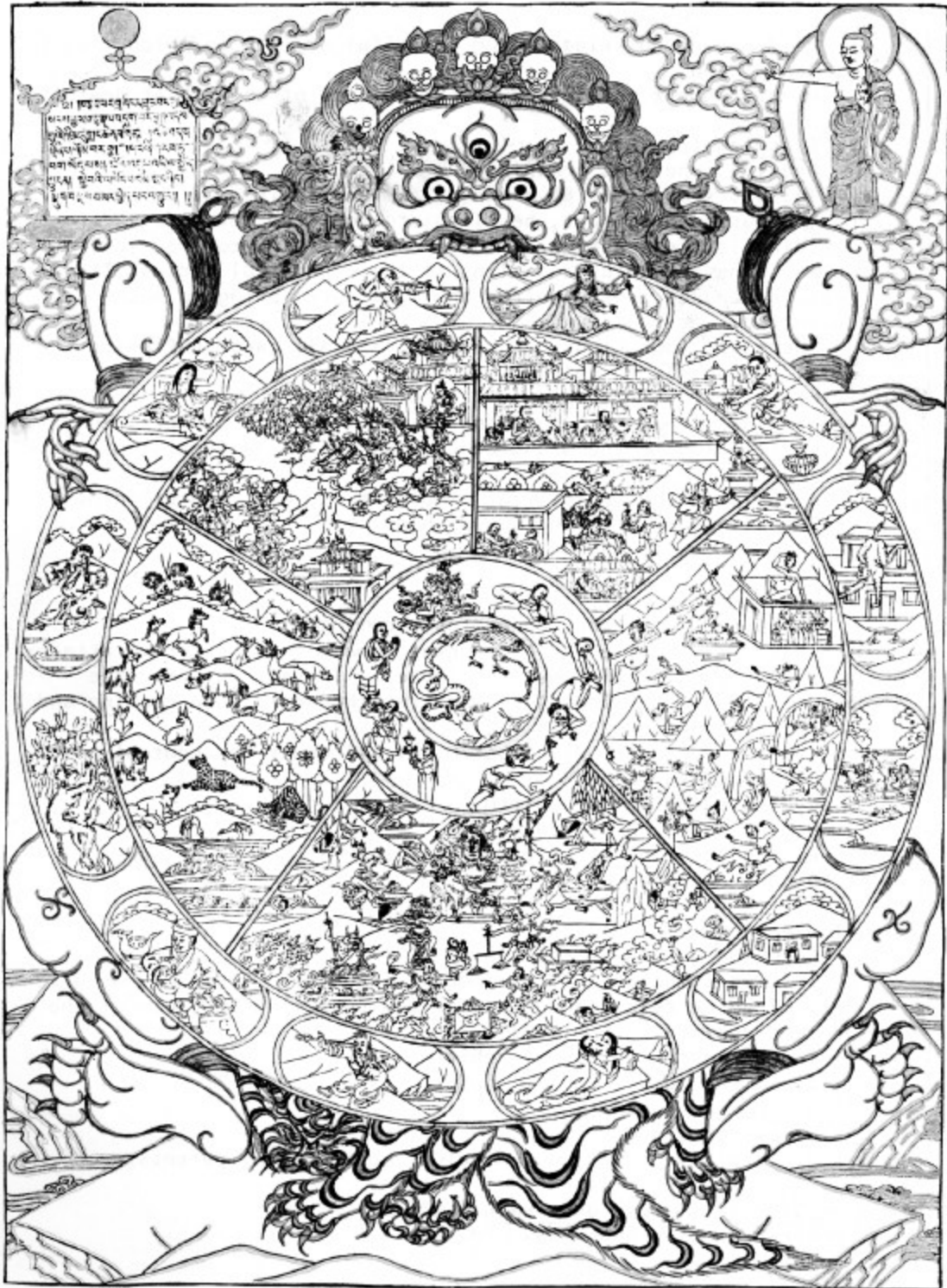
Figure 9—Wheel of Life